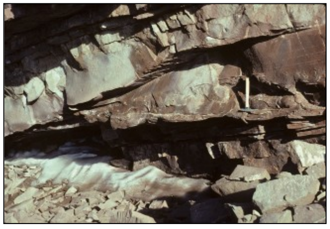
Figure 3 (left): Red sandstones of Canyon Fiord Formation passing vertically into grey carbonateddominated shelf cycles of Belcher Channel Formation, east Blind Fiord, southwest Ellesmere Island

Figure 4 (above): Cross-bedded red sandstones from middle section of Canyon Fiord Formation shown in Fig. 3