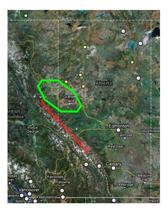
Figure 1: Study area outlined in green

The Deep Basin gas play in Western Canada has been recognized since 1975 as an immense gas resource, the size of which has still not been determined. It is located on the eastern flank of the Rocky Mountain Foothills. The tight, abnormally pressured pools of North-Eastern British Columbia and West-Central Alberta have been shown to respond favorably to refracturing and other types of stimulation. This may represent a very large underexploited resource. Figure 1 shows the study area.