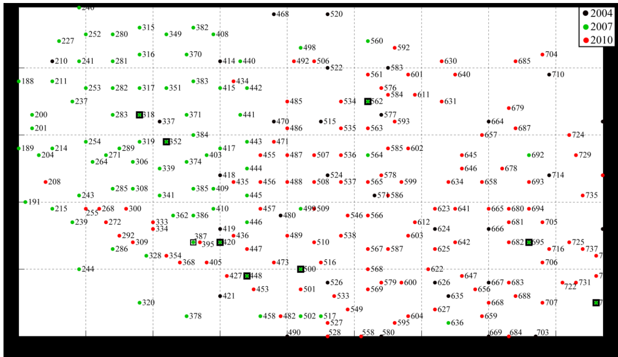
Figure 2: Wells from 2007 with a large drop in coherency due to 2004 wells.

For this example, the change in coherency of the 2007 wells when combined with the 2004 wells is analyzed. Figure 2 shows the wells shaded by year with those having a decrease in coherency greater than 10% highlighted. Wells 318 and 352 from 2007 show a significant reduction in coherency due to well 337 from 2004. Coherency of wells 318 and 352 from case 2 was 93.5% and 63.2% respectively. These were reduced to 79.2% and 51.7% with well 337. Using this information, the facies profile of well 337 with its three nearest neighbors was generated for further checking (Figure 3). There appears to be a significant different in the interpretation of breccia between the wells. This may warrant further review of the available data including core or core photos and petrophysical logs.