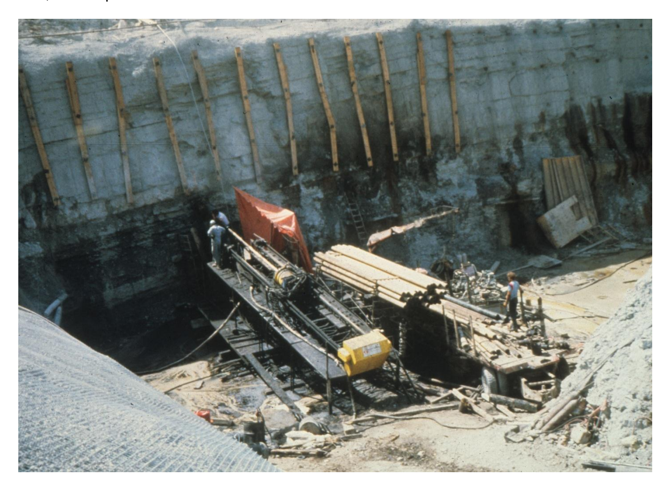
Figure 1: Hawker Siddeley Super Drill 150 in "The Pit".

Figure 1 shows the drilling rig used for all MAISP wells. The rig had been modified to drill at inclinations of 0 to 98°, had a lengthened mast for longer pipe lengths, pulldown was increased from 4500 to 11000 daN, and torque increased from 2700 to 6200 N-m.