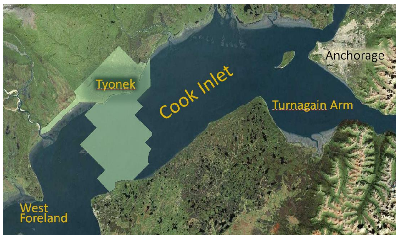
Figure 3 – 320 Square Miles of Contiguous 3-D Coverage (Pale Green)