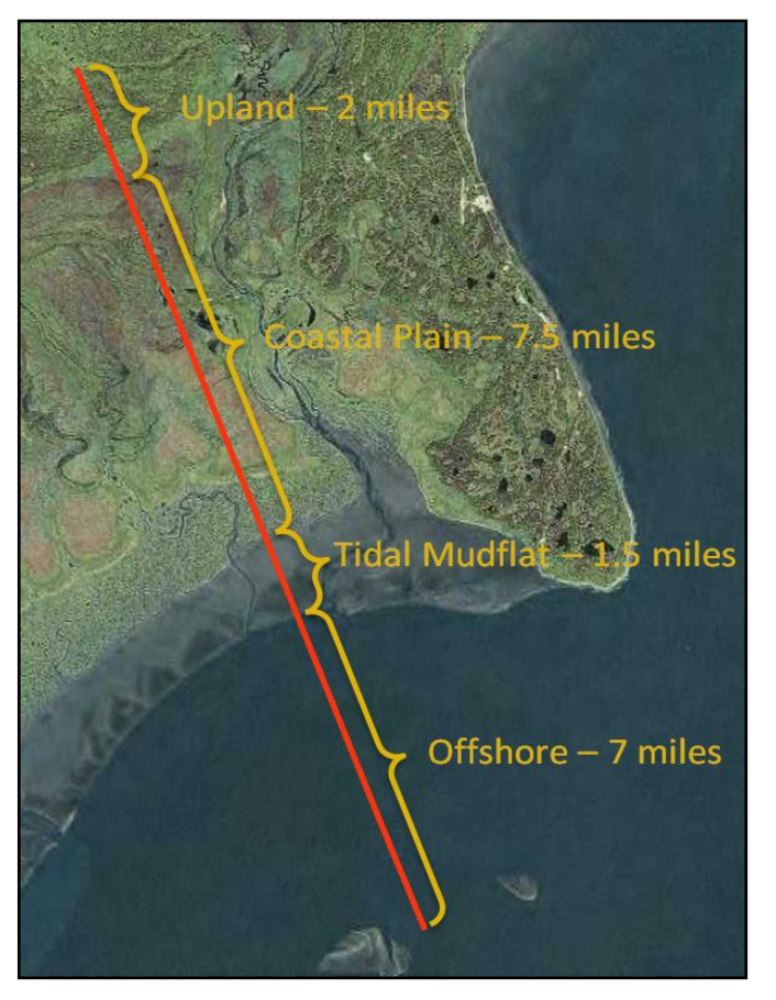
Figure 1 - Test Line Layout, West Foreland

To prove the viability of such a regional 3D program, and to evaluate equipment and parameters, a test program was carried out in early 2011. This test program, which proved successful, was followed by full-scale 3D seismic acquisition starting in the fall of 2011, continuing through the winter of 2011/12 and into the summer and fall of 2012.