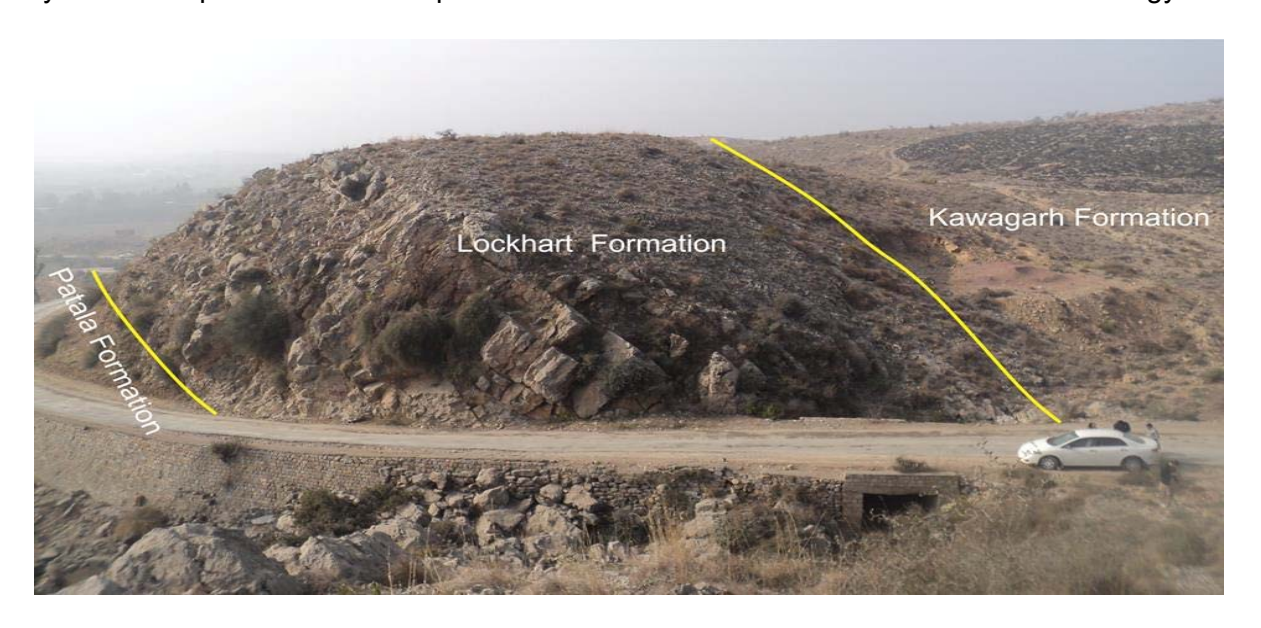
Figure: 2 The photograph show Lockhart limestone overlain and underlain by Kawagarh Formations and Patala Formation respectively in Kahi section.