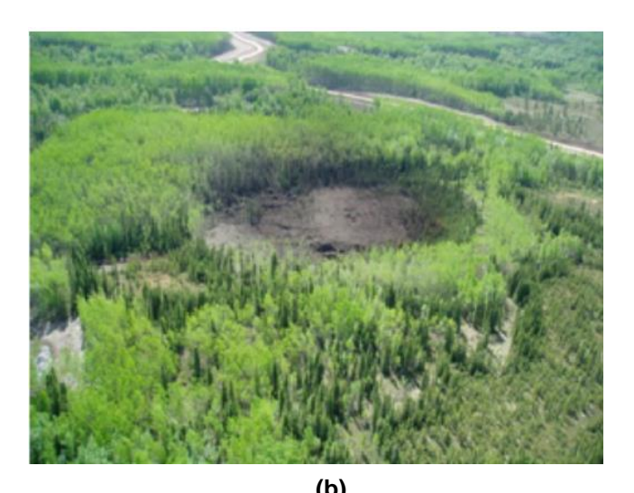
Figure 1. Two infamous cases of in-situ thermal operations in Alberta, Canada leading to (a) surficial spill of bitumen and (b) explosive release of steam.

community to its commitment to the welfare of the society and environment. To accomplish this task, geomechanics community (including regulatory institutes, academia, and industry) along with other parties need to start thinking of establishing a comprehensive structure that, at minimum, will include the following elements: