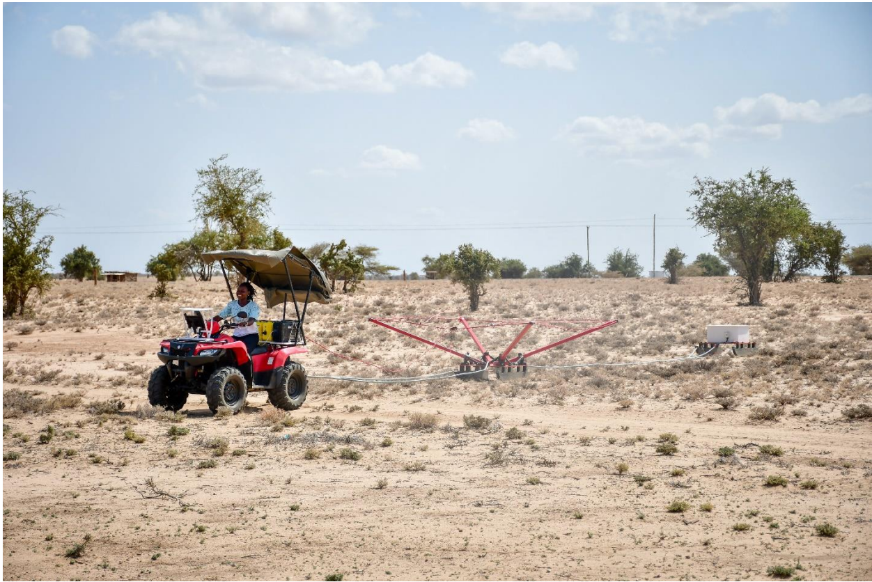
Figure 3: (Denys Grombacher) tTEM data collection at speeds of 5 to 20 km per hour in Turkana West sub-County in Northwestern Kenya. Historically, 1-D resistivity soundings have been the main geophysical water exploration method in this area as well as across much of sub-Saharan Africa. As much of the Turkana desert lies in the East African Rift Valley, the geology is very complex and poorly suited to any type of 1-D mapping approach. Given its high resolution and high productivity, tTEM is particularly well suited to 2-D and 3-D subsurface imaging. While not all resistive targets in the Turkana desert are potable water aquifers, imaged potential aquifers can be further triaged with other methods such as seismic refraction which, for instance, can easily differentiate between high velocity massive volcanics and low velocity sand and gravel.