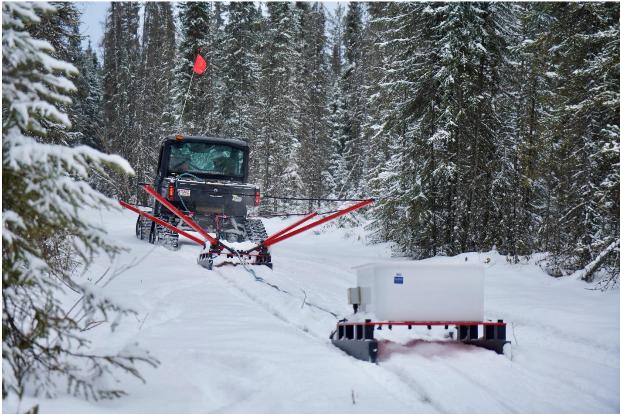
Figure 1: (Brendan O'Brien) tTEM survey in Northern Alberta. The small coil in the foreground is the receiver coil. The larger, 3 m X 3 m coil supported by the four orange struts is the transmitter coil. All electronics are located in the ATV.