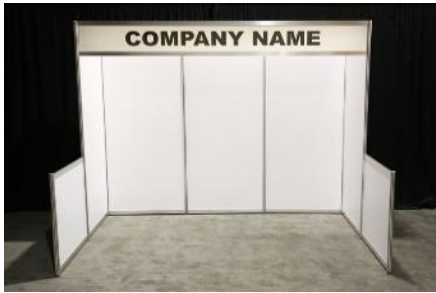
10' x 10' Hardwall Package: