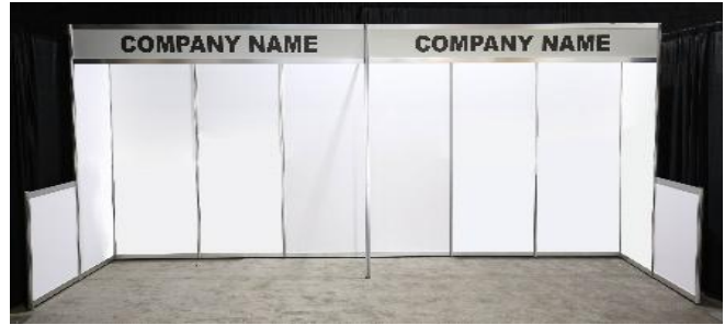
20' x 10' Hardwall Package: